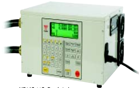
UDNC-M2 Dual-Axis Controller