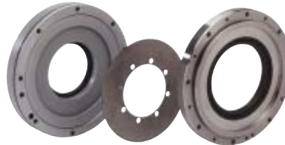
Heavy duty dual disc brake system

The DMTT models utilize the DMNC rotary table bodies for the "drive table." These tables are fixed on a mounting plate. A "full rotary" end support is mounted on the other end of the mounting plate. Both the rotary drive and end support sides are ground together at the factory to assure that the center height, parallelism, flatness, etc. are maintained. The end support is provided with dual thrust roller bearings , and a large spindle with the same thru hole as the rotary drive unit. A rectangular steel plate is bolted and located with fixture keys, to both the rotary and end support. This plate is easily removed however, so that a type of "Quick Change Plate effect" can be realized. The units also feature an "over-travel" system with built-in hard limit switches which can be set by the user to stop the tilting movement, in an O.T. situation.